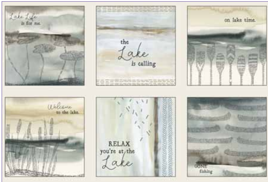
LESC 4517 PA

Fabric Collection by Jetty Home for P&B Textiles