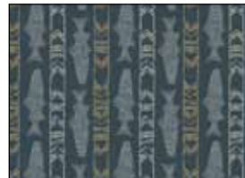
LESC 4520 DB*