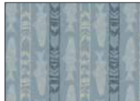
LESC 4520 B