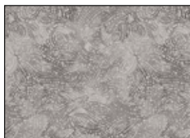
SERE 4492 SS*