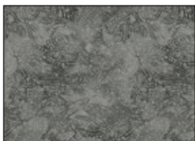
SERE 4492 DS*