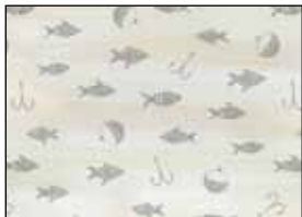
LESC 4519 MU†