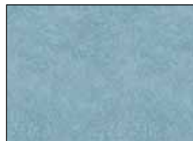
SERE 4492 TB*