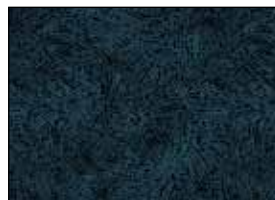
SERE 4492 DB*