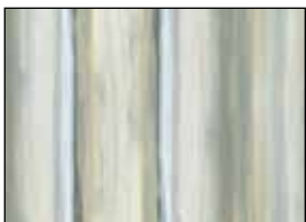
LESC 4521 MU